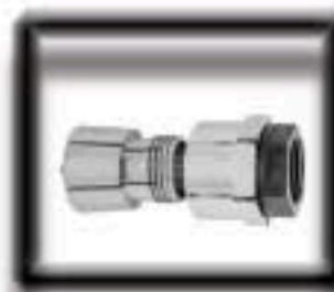
RETAINING AND LOCKING