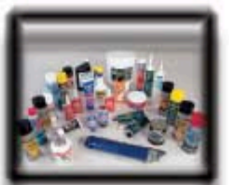
ADHESIVES AND SEALANTS